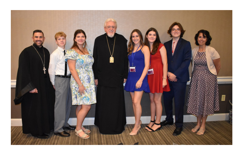
Junior National Executive Board

Please continue to reach out to those in your parish, and keep in contact with parishes near yours. I encourage your parish to become more active, whether locally or nationally, if you are not already. Please feel free to contact me (nds122304@gmail.com / 610-772-5355) if you have any questions, ideas, or wish to become more active within the UOL as a whole.