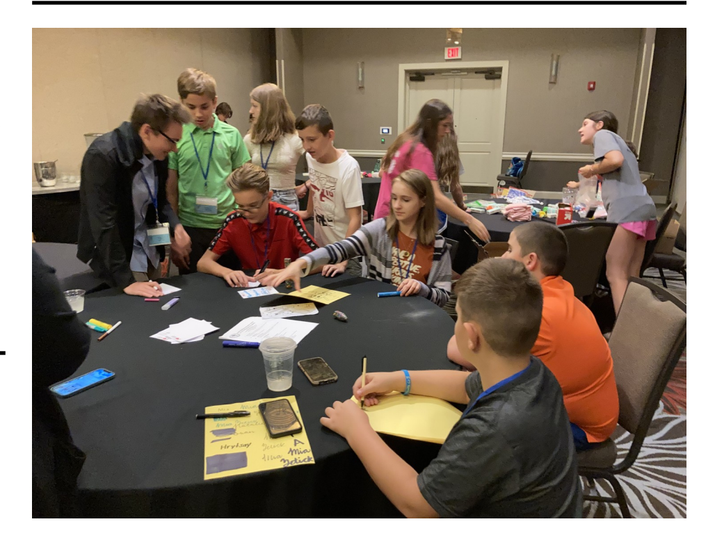
Junior UOL Delegates at the 61st Annual Junior UOL Convention create cards and sort items to prepare for care packages as part of service project.